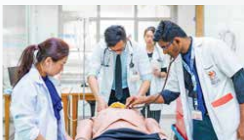
Clinical Skills Lab