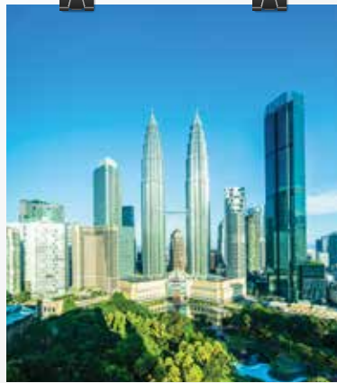
Kuala Lumpur, Malaysia