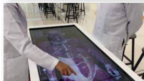
Electronic Dissection Table